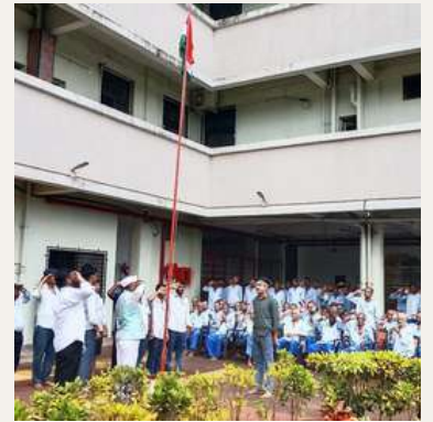
79th Independence Day of India

With music, prayers, food and togetherness, our Prabhujis find family and happiness in every occasion at Apna Ghar Ashram.