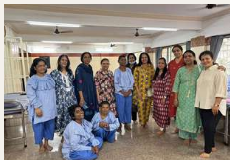
Rotary Team Visit