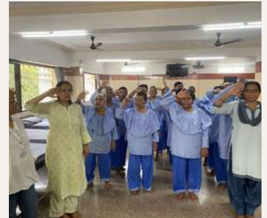
79th Independence Day of India

The celebration of Lord Krishna's birth brought devotion and festivity to the Ashram. The halls were decorated with flowers and lights, and bhajans were sung with great enthusiasm. A special moment was when two of our Prabhujis were lovingly dressed as Radha and Krishna - their smiles and innocence filled every heart with joy and devotion.