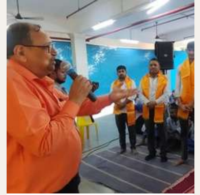
Silver Jubilee Celebration