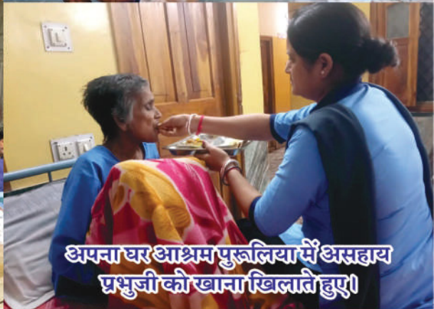
अपना घर आश्रम पुरूलिया में असहाय प्रभुजी को खाना खिलाते हुए।