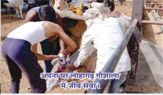
अपना घर लोहागढ़ गौशाला में जीव सेवा।