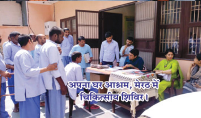
अपना घर आश्रम, मेरठ में चिकित्सीय शिविर।