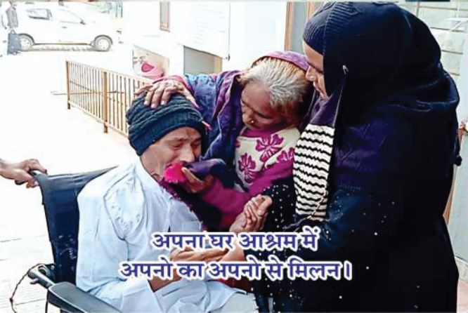
अपना घर आश्रम में अपनो का अपनो से मिलन।