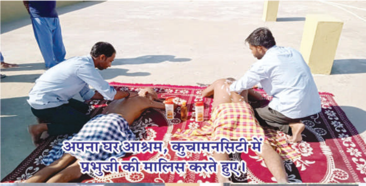
अपना घर आश्रम, कुचामनसिटी में प्रभुजी की मालिस करते हुए।