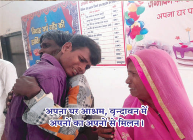
अपना घर आश्रम, वृन्दावन में अपनों का अपनों से मिलन।