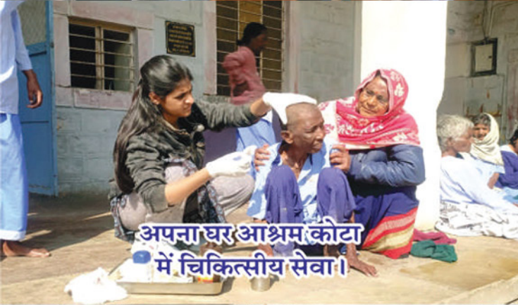
अपना घर आश्रम कोटा में चिकित्सीय सेवा।