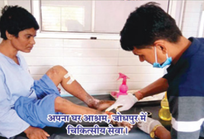
अपना घर आश्रम, जोधपुर में चिकित्सीय सेवा।