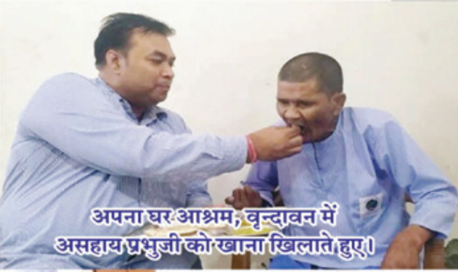
अपना घर आश्रम, वृन्दावन में असहाय प्रभुजी को खाना खिलाते हुए।