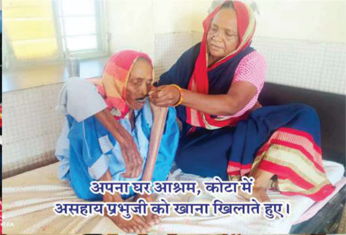
अपना घर आश्रम, कोटा में असहाय प्रभुजी को खाना खिलाते हुए।