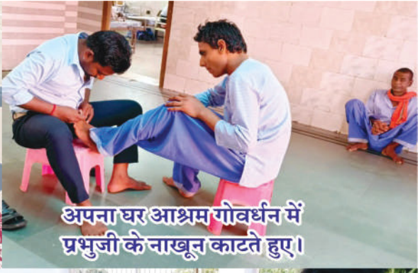
अपना घर आश्रम गोवर्धन में प्रभुजी के नाखून काटते हुए।