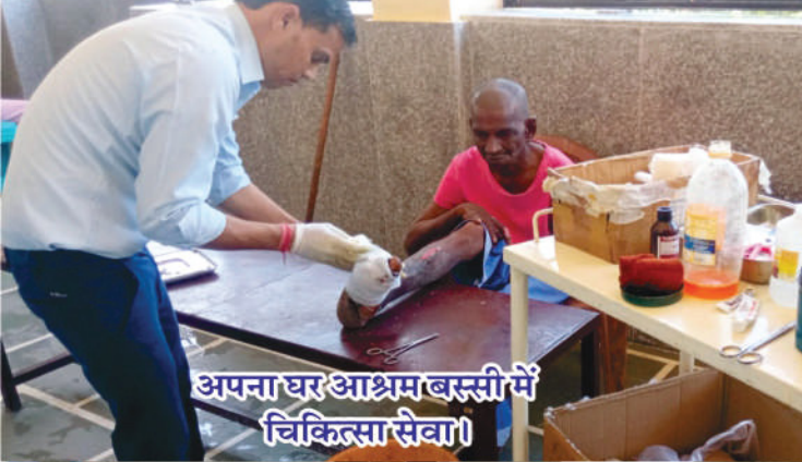
अपना घर आश्रम बस्सी में चिकित्सा सेवा।